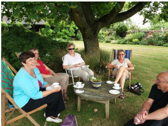
Tea at Down Farm House