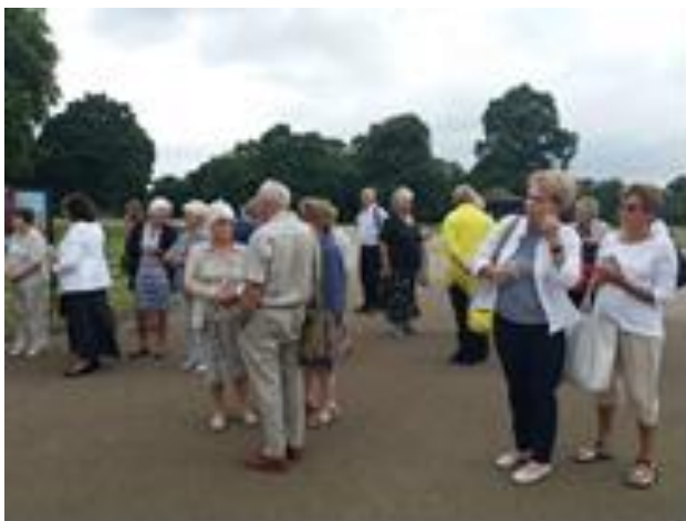
Waiting at the gate!